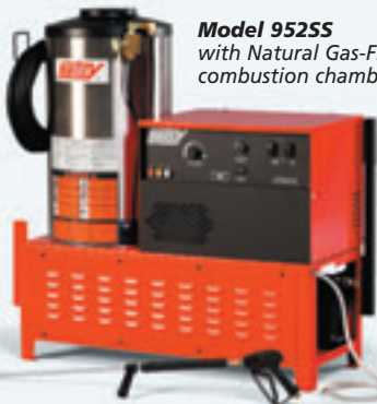
Model 9525S with Natural Gas-Fired combustion chamber

Upright, oil-fired burner delivers high efficiency and maintains constant temperature using diesel fuel, kerosene or home-heating oil